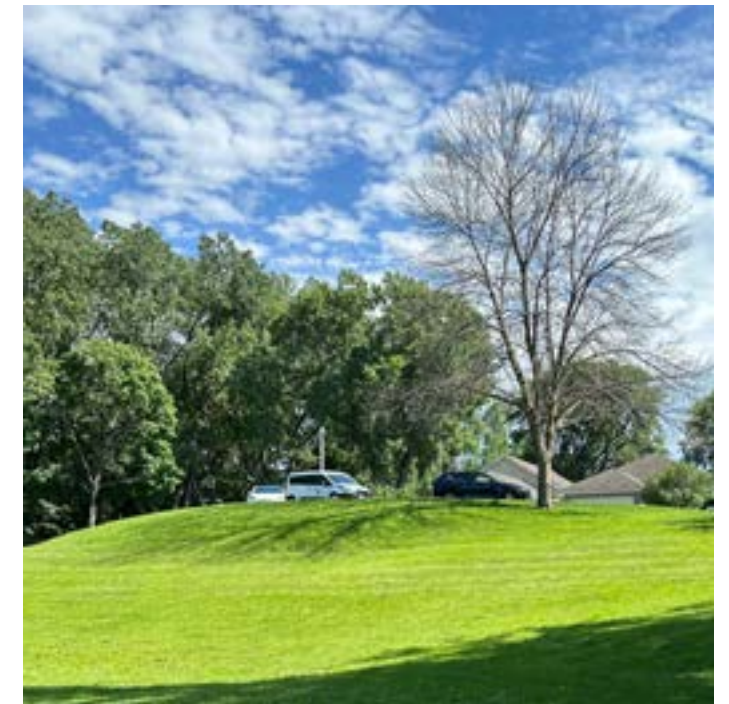
Sledding Hill with a dead ash tree