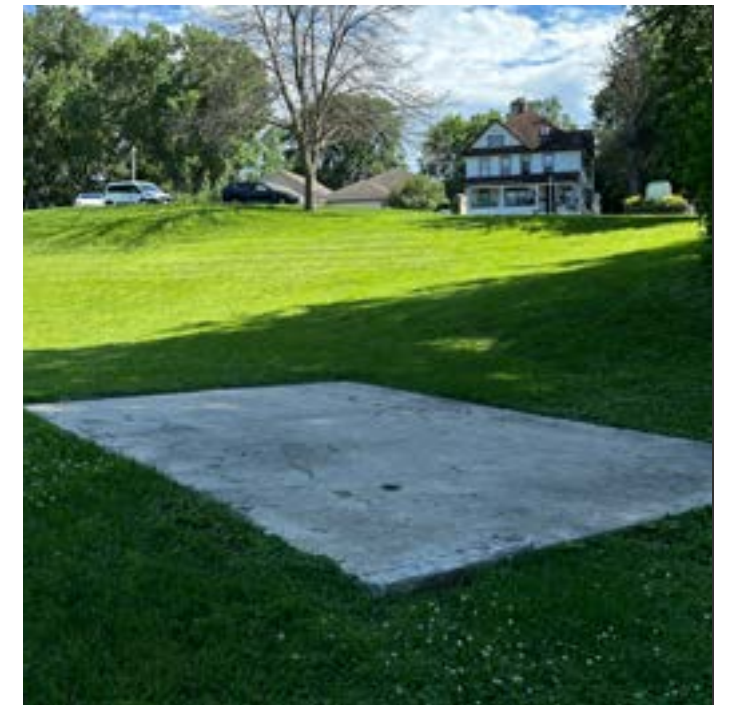
Concrete Pad from previous warming house