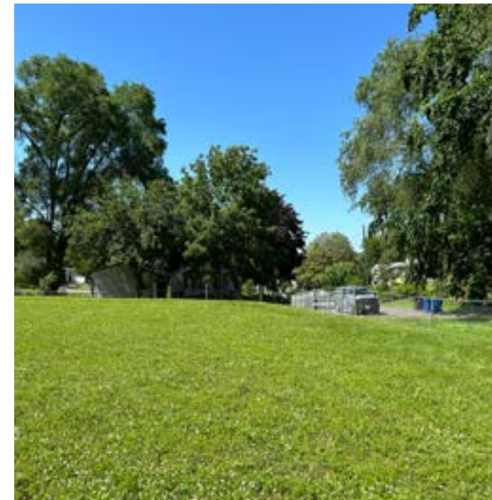
Fenceposts from acquired property, fence rails and fabric removed