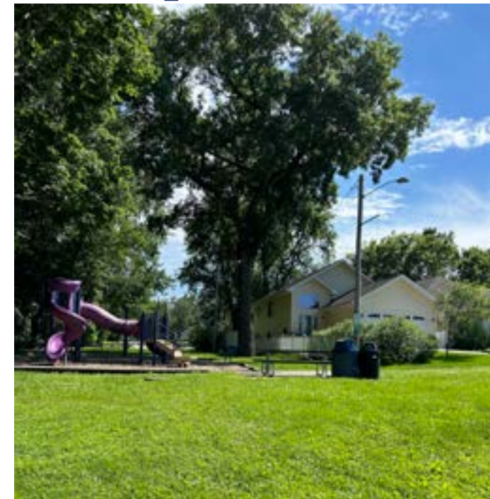
Entrance with small picnic area